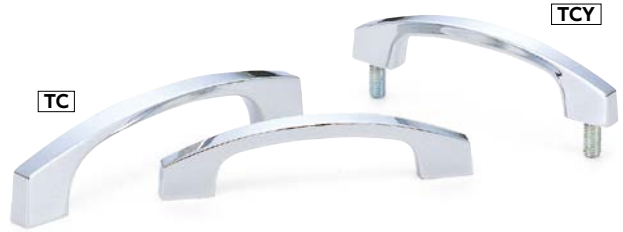
TCY Male Screw